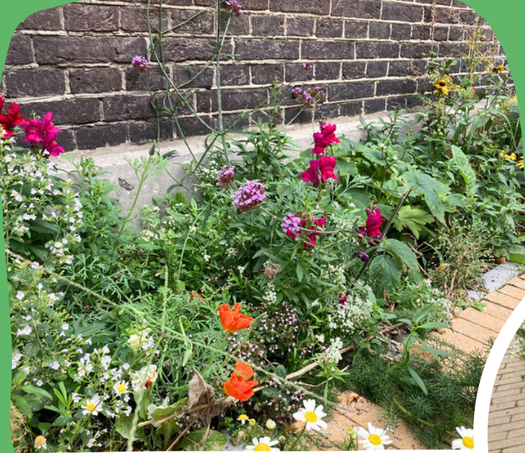
AFTER 4 MONTHS